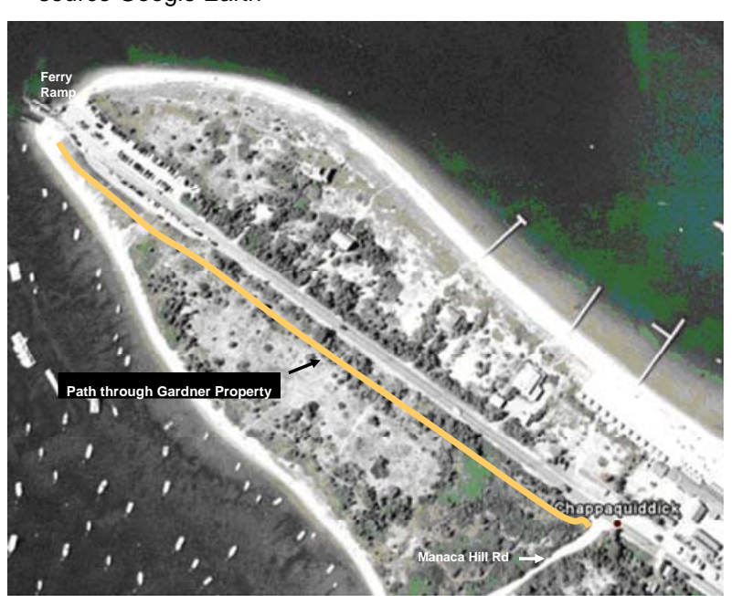
Figure 4. Diagram of demonstration path through Gardner property (0.27 miles).

As part of the initial phase to be funded in this project, we propose that a demonstration path be constructed in the Gardner property from the Chappy ferry to the Manaca Hill Road, based on the project's engineering design (Figure 4).